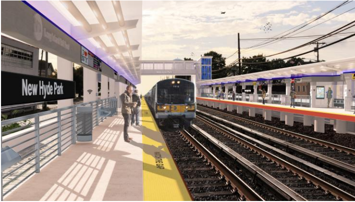
New Hyde Park Station – Modern Aesthetic