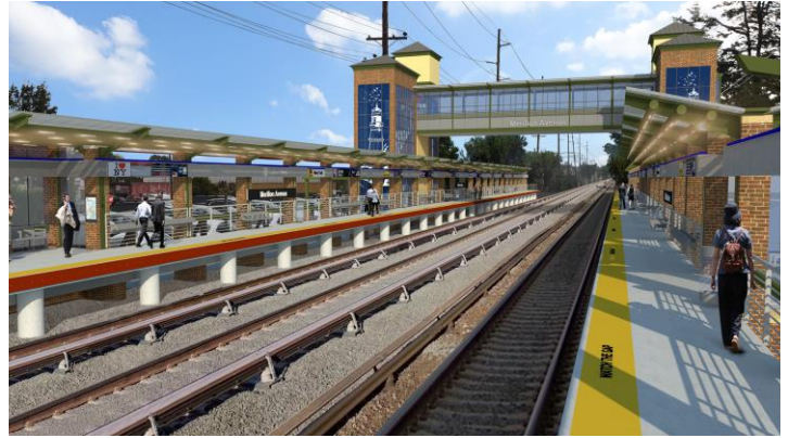
Merillon Avenue Station – Traditional Aesthetic