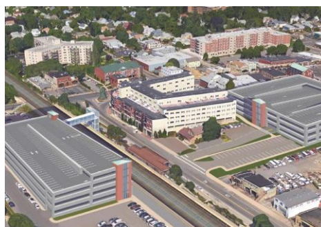
Westbury Parking Garage