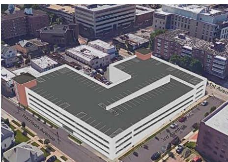
Mineola Blvd. Parking Garage